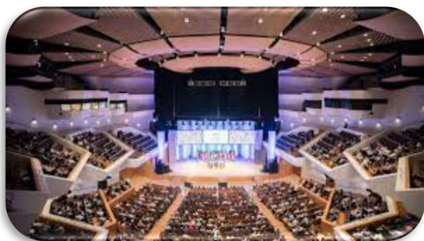
Evening concert in the Waterfront Hall?

Information on car parks close to the Waterfront Hall can be found at https://www.iccbelfast.com/visitor