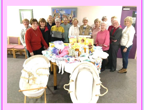
The branch recently presented essential baby items to Baby Basics in Ballynure. Well done ladies!