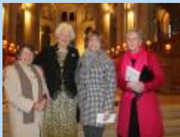
MU Representatives with Guest of Honour, Dame Mary Peters

The Connor MU Diocesan President was accompanied by members of the Trustees and Executive at the Good Samaritan' Service to receive an award towards the 'Away from it All' scheme (AFIA). The generous donation to Mothers' Union for the AFIA scheme was £2000. The scheme provides funding for short breaks to those experiencing stress, financial hardship or other trauma in their lives. It is also available to young people going to summer camps such as Crosslinks or Scripture Union.